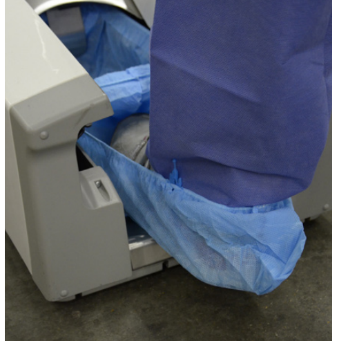
Lentamente tire hacia atrás hasta que la cubierta Repita con el otro pie. se extienda más allá de la punta del zapato, apunte hacia abajo y tire hacia atrás.