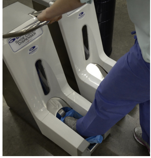
Place one foot in the dispenser, heel first.

Dispensing shoe covers is now as simple as 1 - 2 - 3: