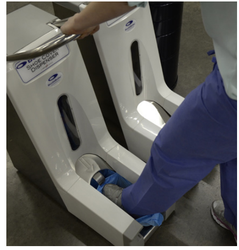
Coloque un pie en el dispensador, primero el talón.