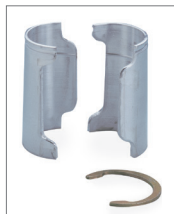
Aluminum Split Sleeves

Bag of four aluminum sleeves with C-rings.