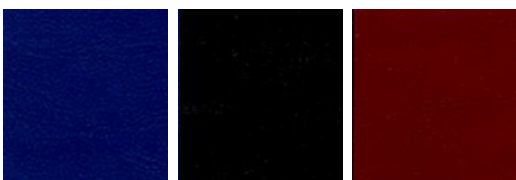
Blue-411 | Black-451 | Burgandy-461